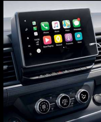
Apple CarPlay™ smartphone mirroring