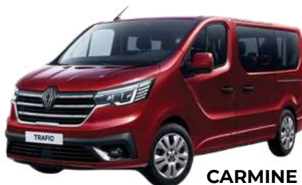
CARMINE RED (SPEC AMEND OPTION)

photos not contractually binding. *not available with body coloured bumpers