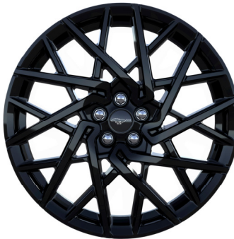
20" Alloy Wheels In Black