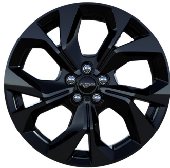
19" Alloy Wheels In Black